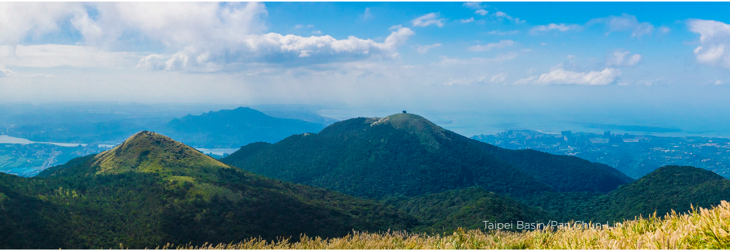
Taipei Basin/Pan Chun-Lin

ment and Shetter, entrepreneurial assistance, family support, and group counseling; operation and effects of victims support services and restorative justice such as the support all the way program, kindness programs, skill training, and international exchange. At last, we have a comprehensive and well-structured overview all the way from after-care services in the prison to probation treatment and after-care services beyond the prison. The book offers a more in-depth introduction covering victims support, volunteer services and various promotional activities for crime prevention, such as anti-drug, anti-birbery and law-related education, which shall give readers a more thorough understanding of the judicial protection system in Taiwan.