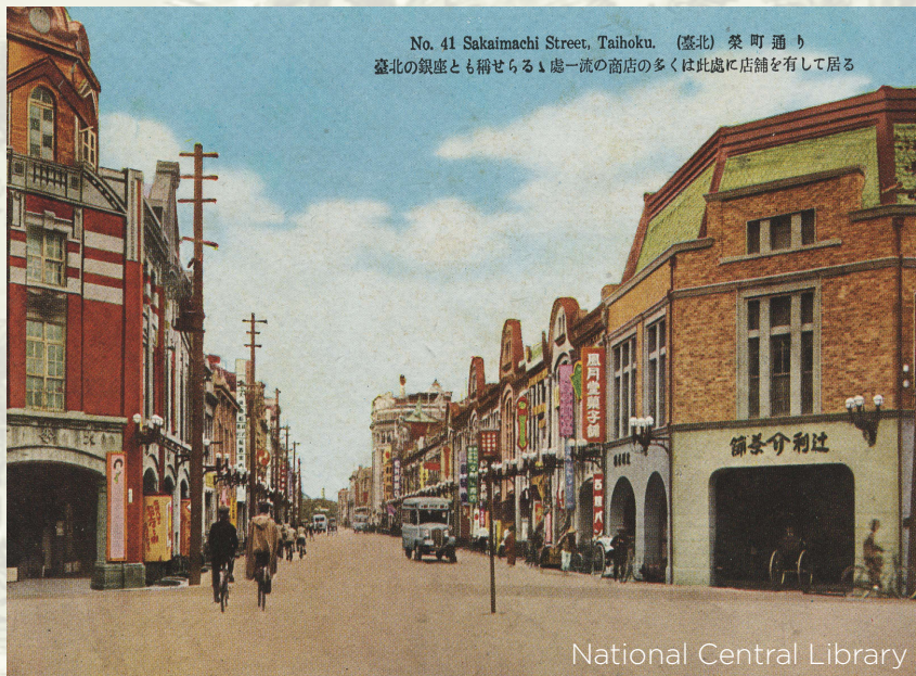
National Central Library