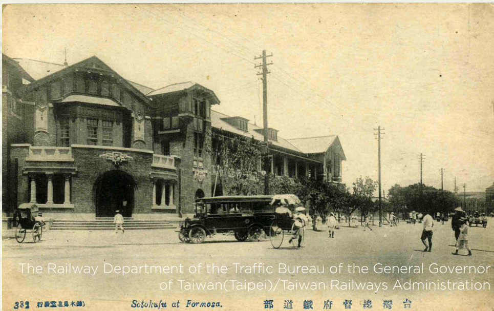
The Railway Department of the Traffic Bureau of the General Governor of Taiwan (Taipei)/Taiwan Railways Administration