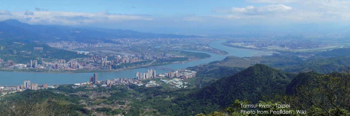
Tamsui River, Taipei