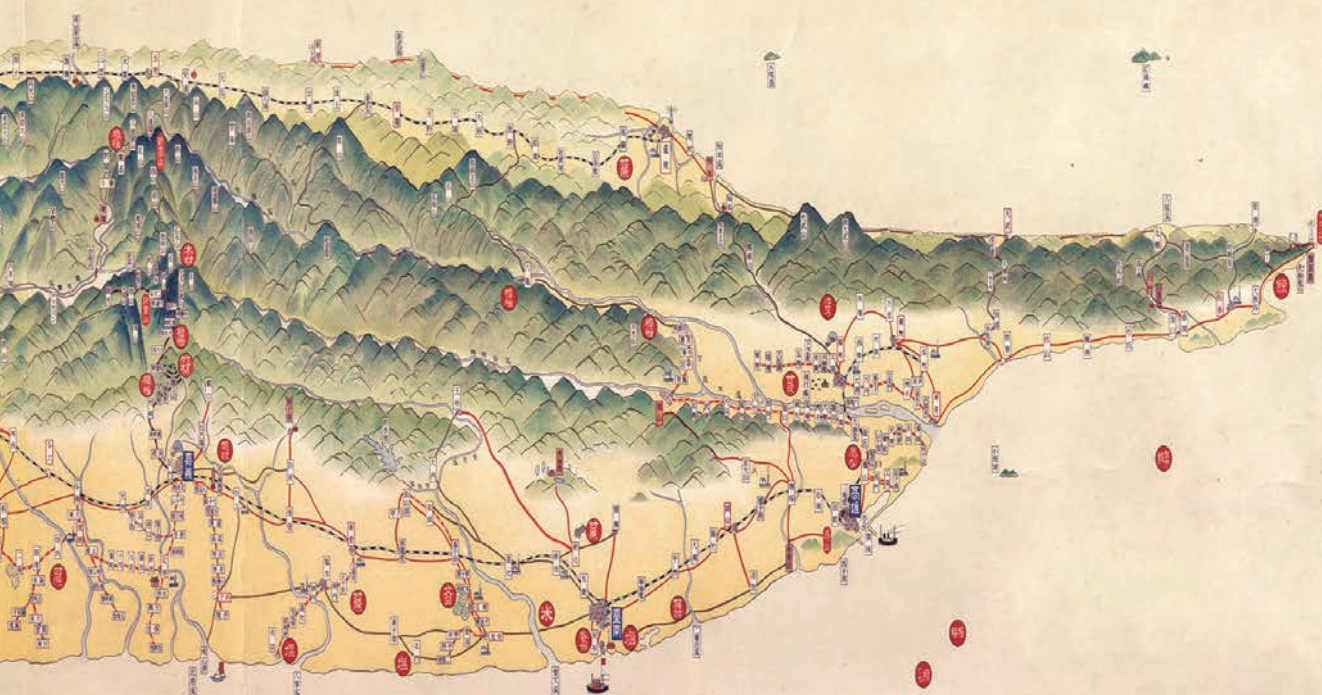
A.D. 1931 Taiwan