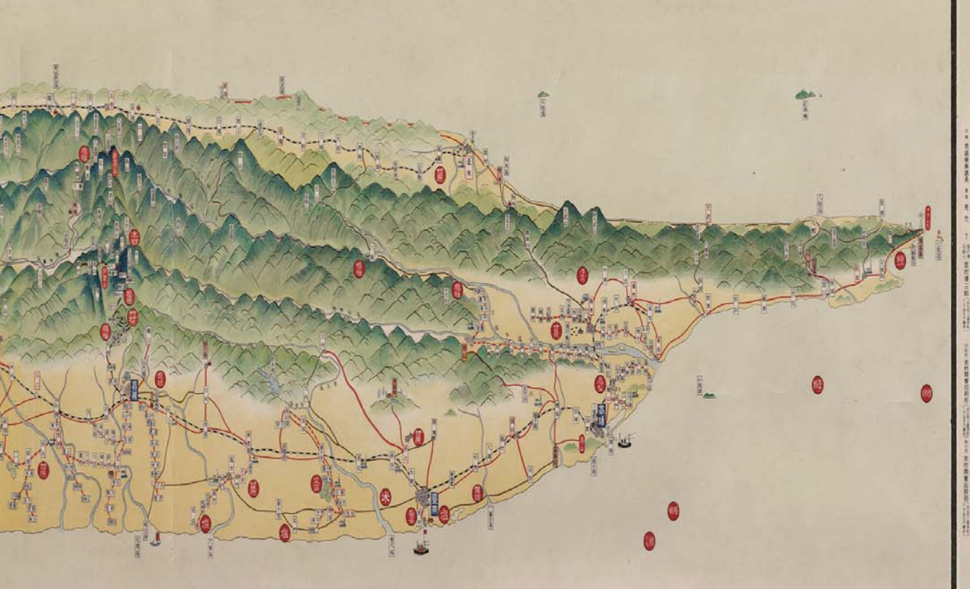
A.D. 1931 Taiwan