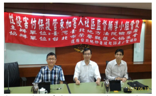
A meeting of the community monitoring and guidance task force, 13 Jun., 2013

Prosecution authorities are vital in the prevention of sexual assault crimes. From the perspective of the rule of the vital few, most crimes are committed by a minor set of repeat offenders; furthermore, sexual assault crimes have always seen underreporting and low