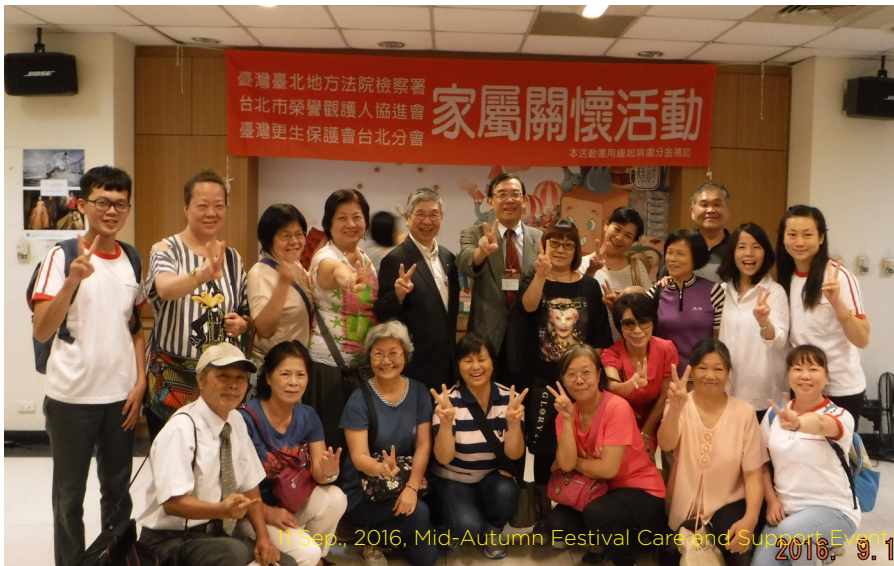
11 Sep., 2016, Mid-Autumn Festival Care and Support Event