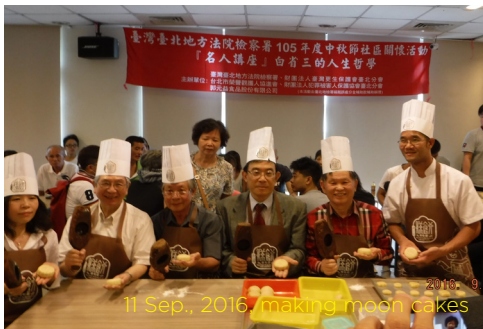
11 Sep., 2016, making moon cakes