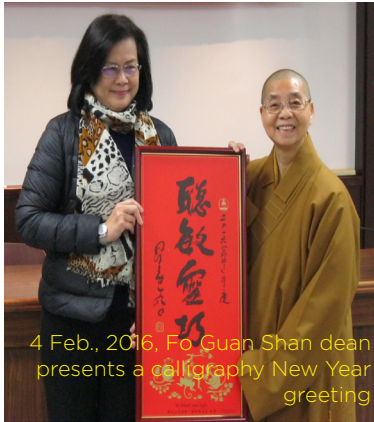
4 Feb., 2016, Fo Guan Shan dean presents a calligraphy New Year greeting