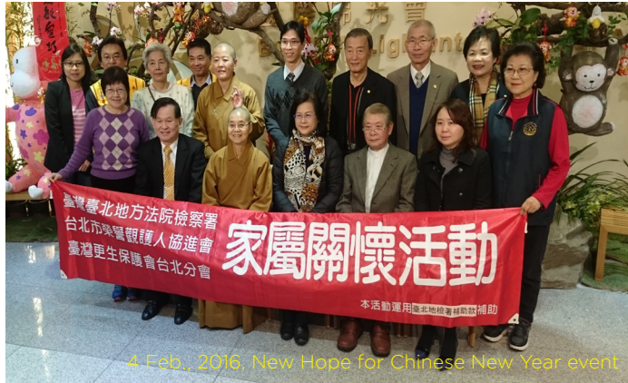
4 Feb., 2016, New Hope for Chinese New Year event