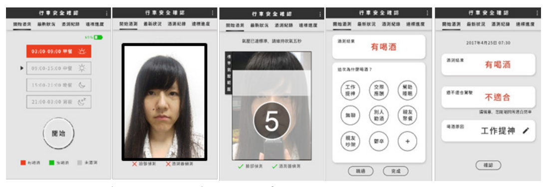
Figure 2. Breath Test Procedures Interface

in daily life in order to pin point the defendant's risk of repeated drunk driving offenses, to enhance the effectiveness of care and treatment and to prevent the defendant from drunk driving again.