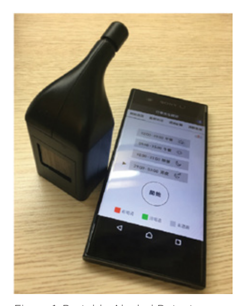
Figure 1. Portable Alcohol Detectors and Application Devices in Smart Phones

To develop and establish mobile technology support system to prevent repeated drunk driving offenses in order to integrate judicial, medical and