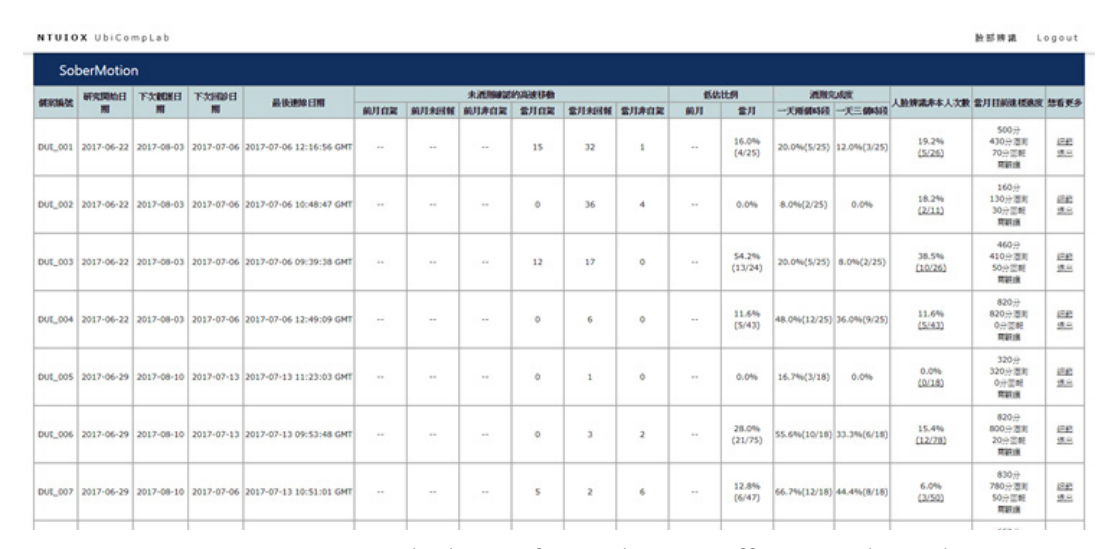
Figure 3: Monitor service web design for Probation Officers and Psychiatrists