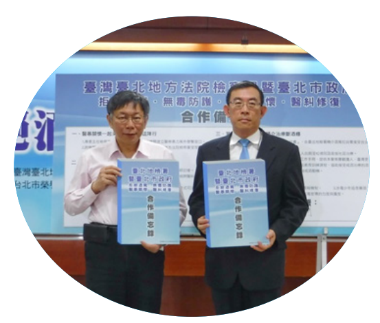
5 Jan., 2017, the Mayor Ke of Taipei City Government and Chief Prosecutor Hsing of TDPO singed the Cooperation Memorandum

According to foreign researches (currently, there are no relevant domestic information), the prevalence rate of alcohol addiction in drunk driving cases is about 30 percent. Not all drunk driving defendants are alcoholic addicted. Most drunk driving defendants started as problem drinker. Therefore, early intervention with problem drinkers among the drunk driving defendants can effectively prevent this type of defendants from becoming alcoholics and indirectly reduce the harm done by the