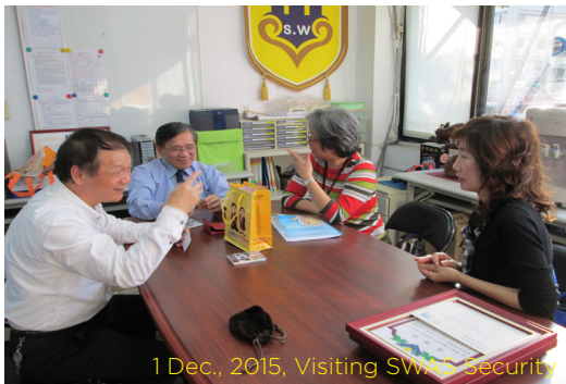
1 Dec., 2015, Visiting SWAS Security