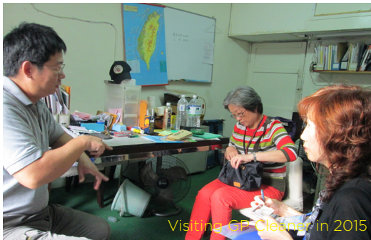
Visiting CP Cleaners in 2015