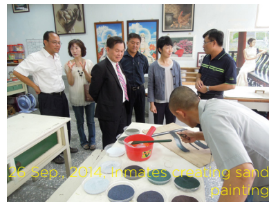
26 Sep., 2014, Inmates creating sand painting