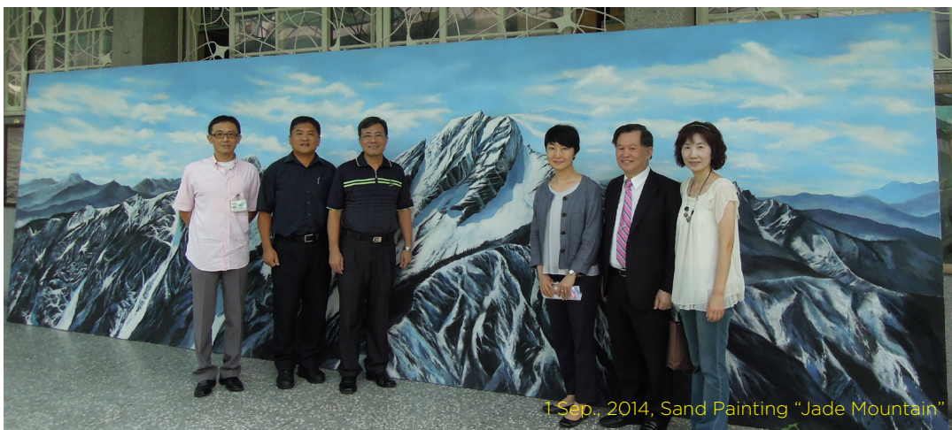
1 Sep., 2014, Sand Painting “Jade Mountain”

Taiwan After-care Association Taipei Branch, Yuanta Cultural and Educa-