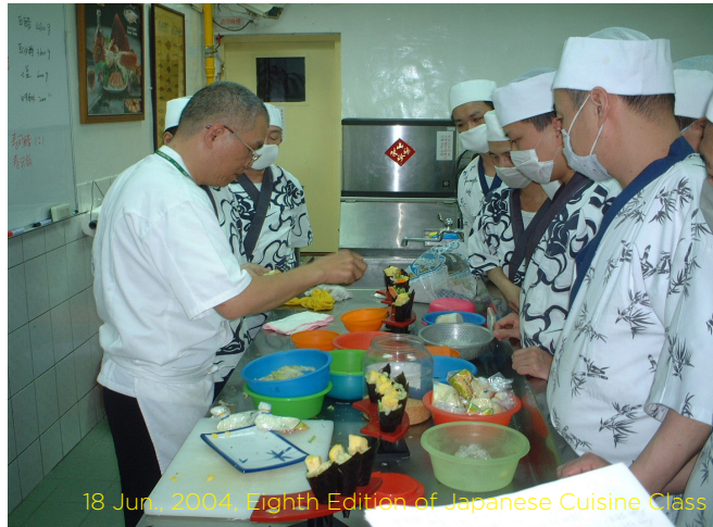
18 Jun. 2004, Eighth Edition of Japanese Cuisine Class