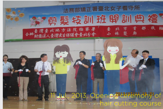
11 Jul, 2013, Opening ceremony of hair-cutting course