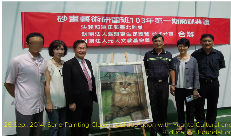
26 Sep., 2014, Sand Painting Class in collaboration with Yuanta Cultural and Education Foundation