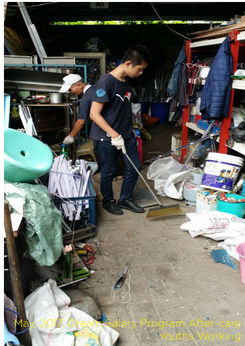
May, 2017, Dream-Salary Program After-care Youths Working