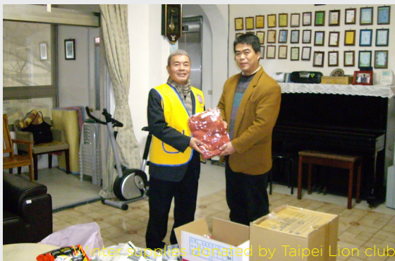
Intel supplies donated by Taipei Lion club