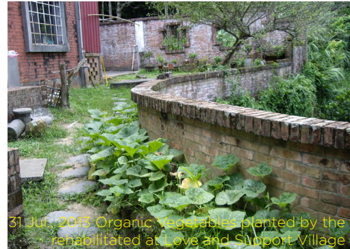
31 Jul., 2013 Organic vegetables planted by the rehabilitated at Love and Support Village

To enable the rehabilitated who are HIV-positive, have been released from prison and have a history of drug-related offences to thoroughly free themselves from the influences and harms of drug addiction on body, mind, and soul, the Branch cooperates with Operation Dawn to establish the “Love and Support Village”. Through group support and guidance, as well as proper care, religious guidance, psychological counselling, and skill training, the rehabilitated could have properly develop their character and recidivism rate may be reduced. The establishment also assists the rehabilitated with medical care to manage their AIDS conditions and helps them re-adapt to society and face the public, realizing the function of direct protection of the rehabilitated.