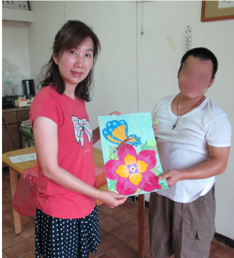
Right: The rehabilitated with drug addiction presents own painting to the Branch Upper left: Staff members visit the rehabilitated every month Lower left: Placement Case Meeting