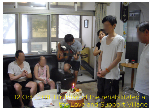
12 Oct., 2013, Birthday of the rehabilitated at the Love and Support Village