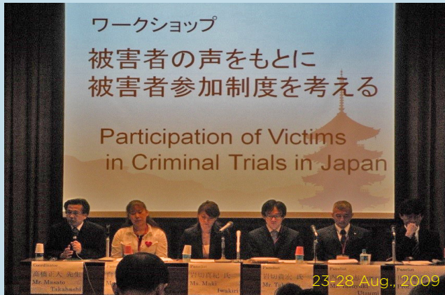
Annual Japan Victimology Conference and Delegation