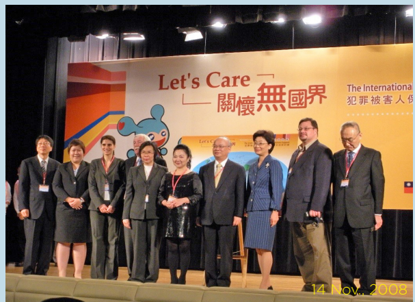
Let's Care – International Conference on Victims Support in Taiwan