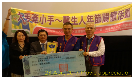
23 Apr, 2017 Movie appreciation