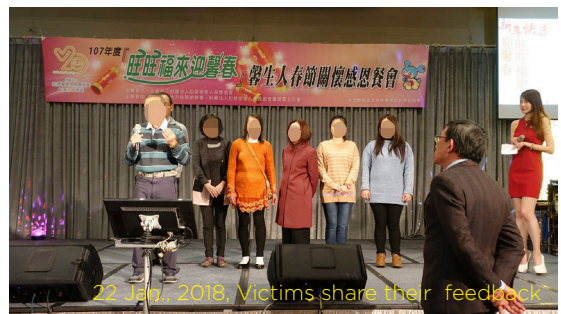
22 Jan., 2018, Victims share their feedback