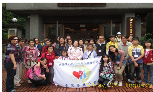
5 May, 2014, Jinguashi