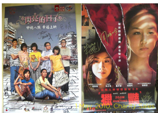
1 May, 2010, Charity Sales

family finance, child rearing and education. The emotional and physical stress is enormous. To some, Mother's Day is just another excuse for celebration. At this time of the year where thanks are due, let us gather our thoughts, love and passion, and shower all mothers and fathers, husbands and wives, as well as children with warm wishes.