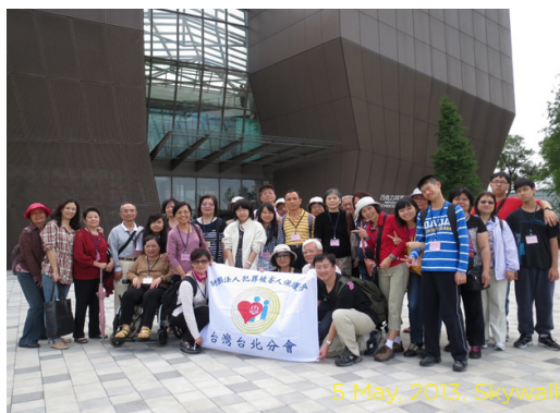
5 May, 2013, Skywalk