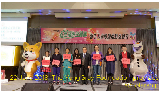
22 Jan., 2018, The YungGray Foundation provides scholarship