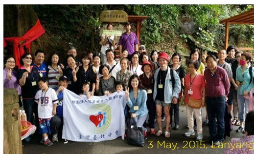
3 May, 2015, Lanyang