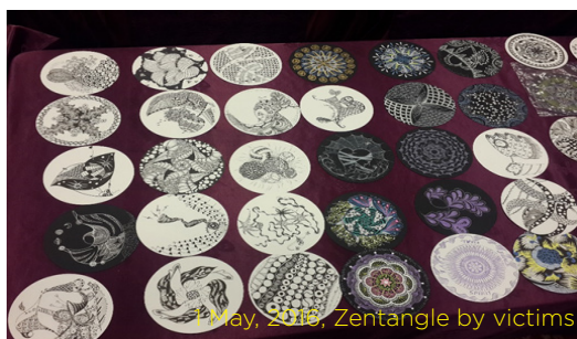
4 May, 2016, Zentangle by victims