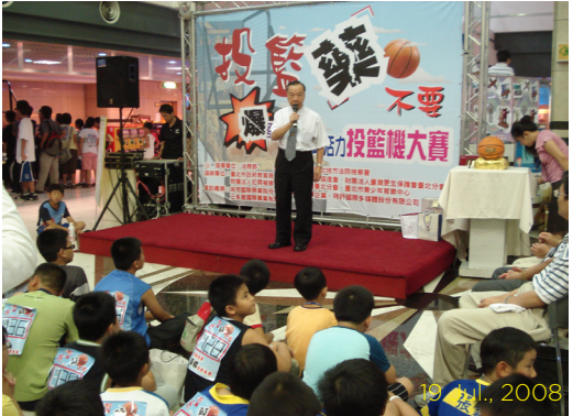
Anti-Drugs Basketball Shooting Machine Competition