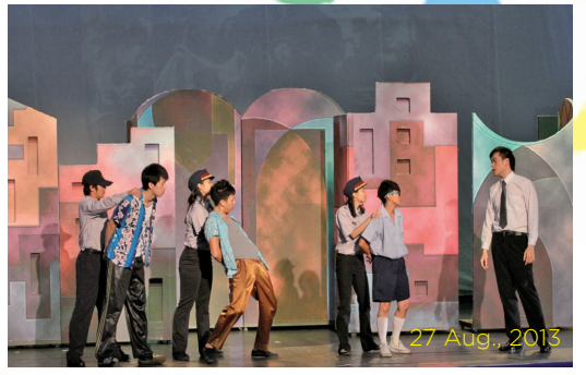
Paper Windmill Theatre "Young Faust" Anti-Drugs Drama