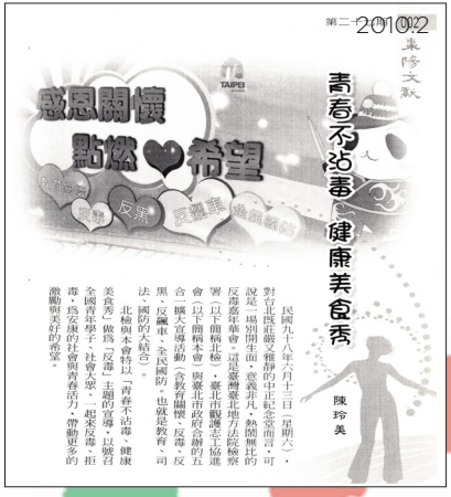
"New Ray of Hope in 2009" Food Fair and Anti-Drugs Promotion