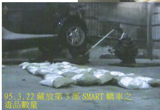
95.3.22 藏放第 3 部 SMART 轎車之 毒品數量