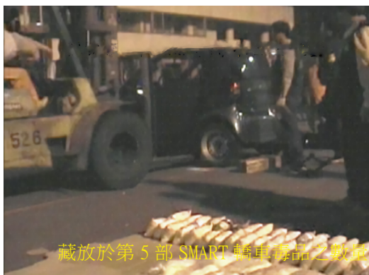
藏放於第 5 部 SMART 轎車毒品之數量