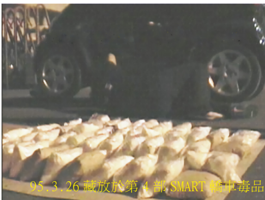
95.3.26 藏放於第 4 部 SMART 轎車毒品