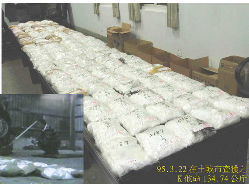
95.3.22 在土城市查獲之 K 他命 134.74 公斤