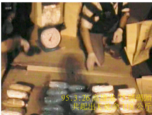
95.3.26 高雄港 75 號碼頭 共起出 K 他命 118 公斤

高雄港，專案小組旋於 26 日凌晨 1 時於高雄港 75 號碼頭在高雄關稅局協助下執行開櫃檢查，果於現代公司「海森威」貨輪上之乙只貨櫃（編號 HDMU2360158）所裝載之 2 部同款 SMART 小型轎車底盤內再起出 105 包三級毒品 K 他命，毛重約 118 公斤。