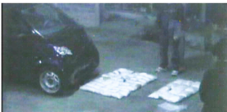
95.3.22 藏放第 2 部 SMART 轎車之毒品數量