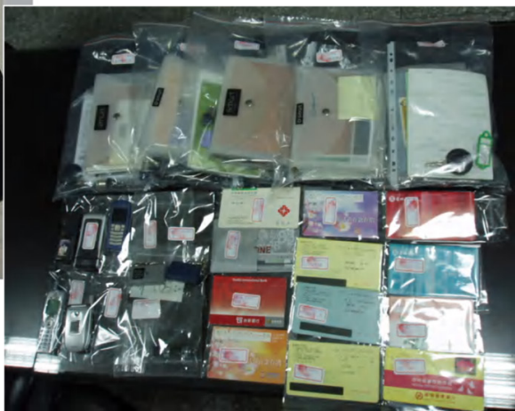
95.3.30 12 本銀行存摺