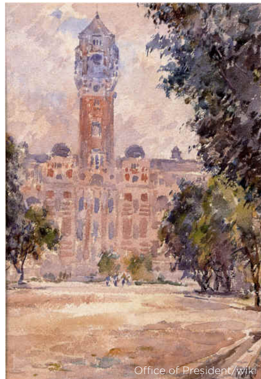
Office of President/wiki

Before the criminal group had the opportunity to deliver drugs in large amounts, we solved the case to effectively prevent these drug being spread. Otherwise, if the aforementioned drug transportation routes were smoothly operated, a large amount of heroin would be delivered to Taiwan from the Indo-China Peninsula and across mainland China. The consequences would be unimaginable.